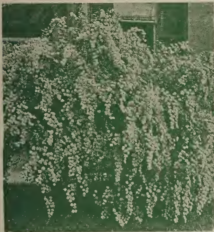
Bridal Wreath (Spirea Van Houttei)

FERNOLA —The finest plant food for ferns and house plants. Pkg., 13c. 2 for 25c Postpaid.